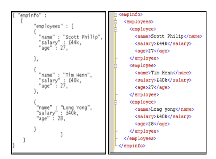
Figure 3: Same Source Data as seen in XML and in JSON

It should be noted that APIs are sometimes used with the IaaS and SaaS service models as well. For example, the Amazon EC2 API allows users to create and start entire new virtual systems using API calls, while many SaaS providers expose some or all of their datasets through an API.<sup>85</sup> Regardless of the functionality and/or data exposed through an API, the vulnerabilities are much the same. However, because the PaaS tier consists primarily of machine-to-machine services, APIs establish the foundation of such services.