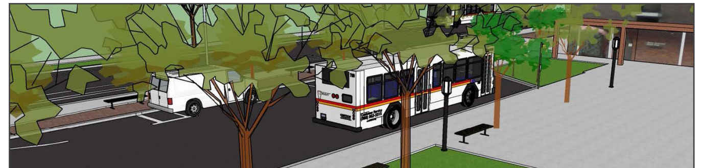
Figure 15: Rendering of transit hub at McNary Dining Hall designed by OSU Civil Engineering students.

The OSU Transportation Plan includes a recommendation for a mobility hub near the intersection of Jefferson Way and SW 15th Street. In 2019, an OSU civil engineering course tasked with designing a regional transit hub on the Corvallis campus recommended repurposing the parking lot south of Jefferson Way adjoining McNary Residence Hall for this purpose (Figure 15). Preliminary design work has already begun to determine the capacity of the lot to accommodate transit vehicles and site amenities such as shelters, benches and bike parking.