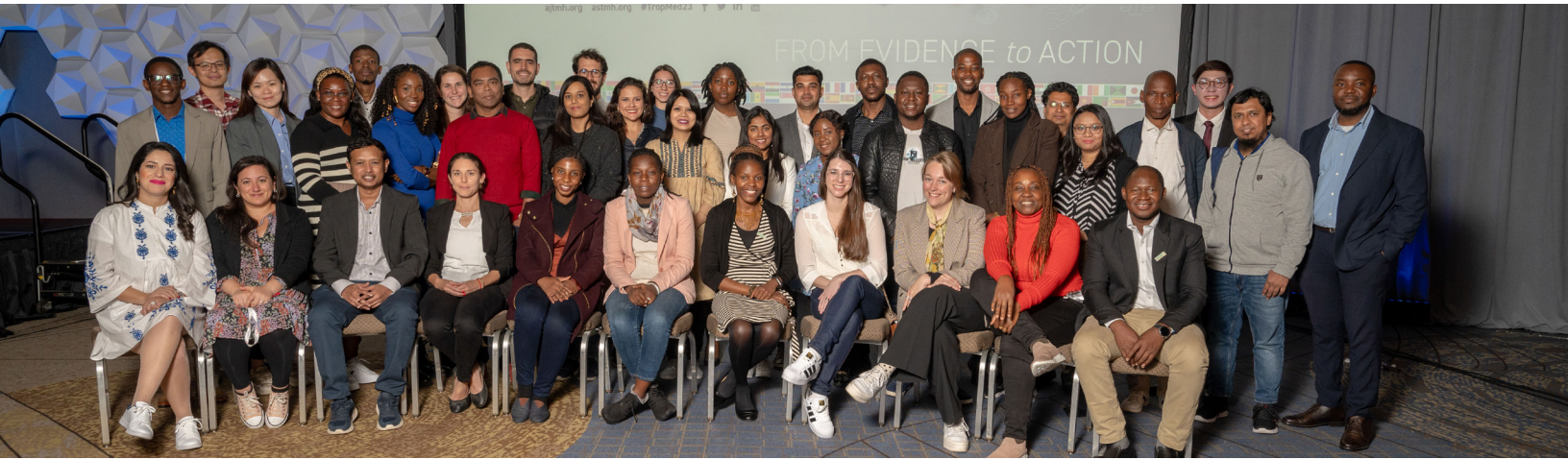
2023 ASTMH/BMGF Travel Award Recipients (not all recipients present)