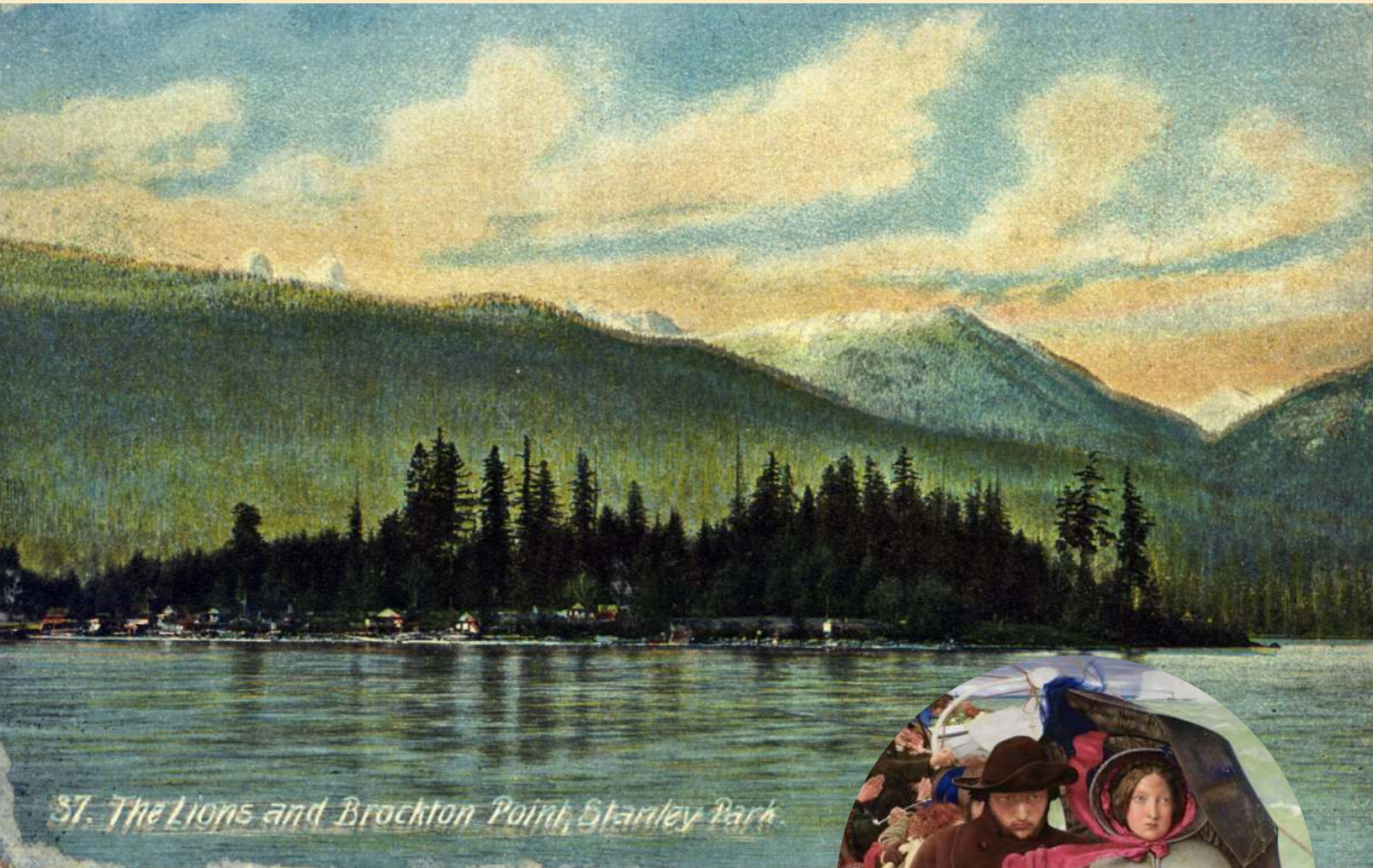
Banner Image: "The Lions and Brockton Point, Stanley Park," n.d. MSC130-11067_01