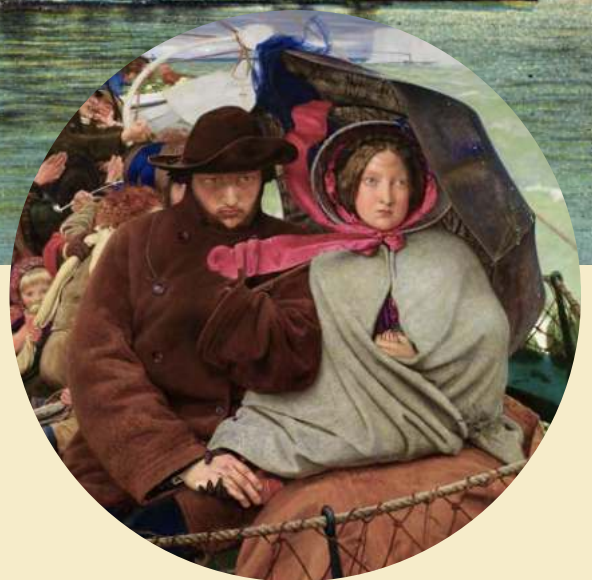
The Last of England. Ford Madox Brown, 1855. Birmingham Museum and Art Gallery.