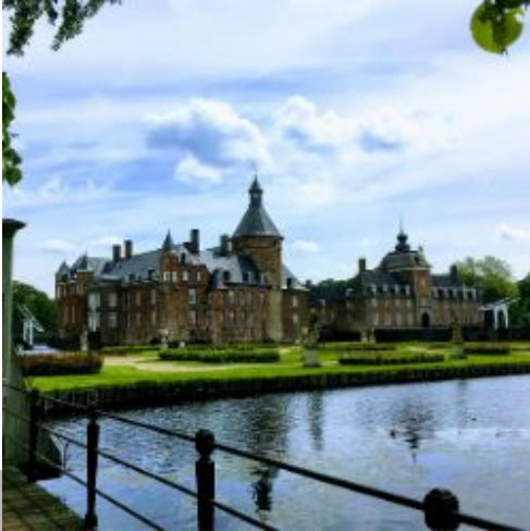
The Wasserbürg Castle - one of many castles I visited when I lived in Germany back in 2017