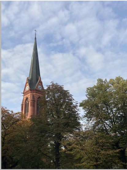
I love seeing this view of St. Lukaskirche when I walk to work!