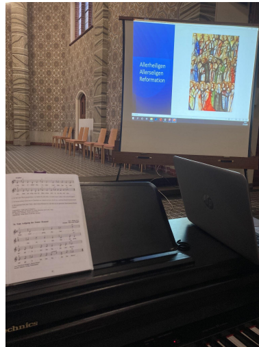
Preparing the presentation for the Kindergarten class

In the midst of all this, I am also still helping plan the Intensive Study week in Wittenberg for our seminary in Riga, Latvia. This course takes place October 31-November 5 - what better way to start the week than by celebrating the Reformation in Wittenberg itself!