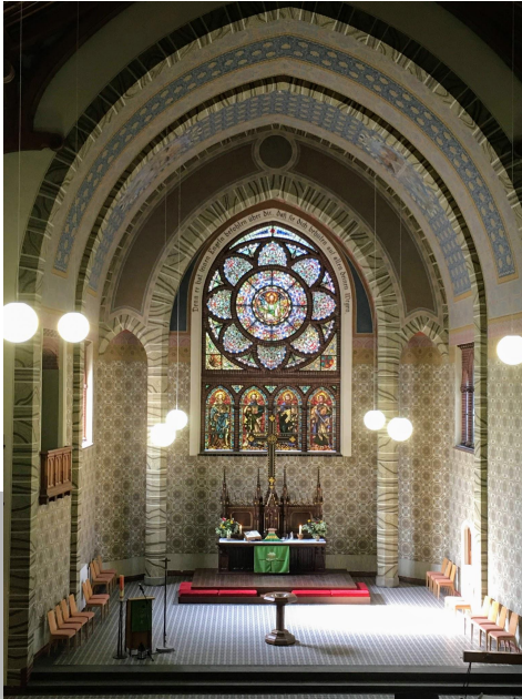
The beautiful view inside of St. Lukaskirche