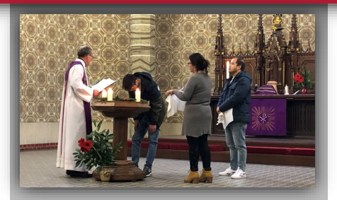
Our most recent Baptisms during Advent!