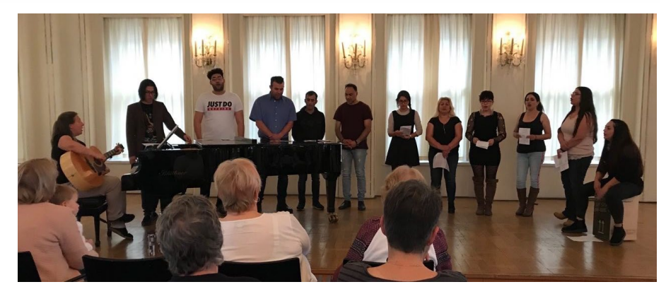
Our Persian choir at the Leipzig Intercultural Week concert

Late last year, our Persian choir was invited to sing in a concert as part of the city of Leipzig's Intercultural Week. We joined together with a Ukrainian children's choir and a trio from Syria to perform at a concert hall in the city center. We sang many original songs, as well as old Persian tunes with new Christian lyrics—all composed by church members. Many in the audience were visibly moved by the refugees' singing. Since I had been asked to give translations of our song titles and summaries of the content of each song in German, everyone who read the program notes knew exactly what the Persians were so passionately singing about: the peace, hope, and salvation we have in Christ.