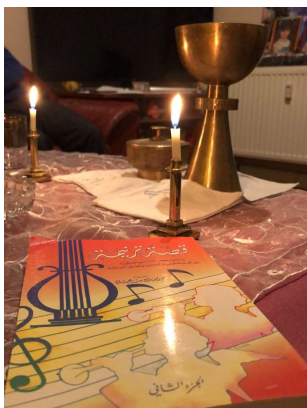
Coffee table altar at our Arabic house church in Borna