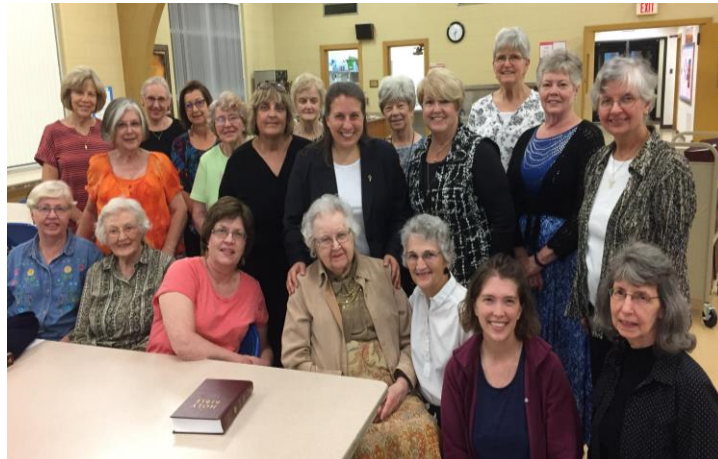
One of the special groups I have visited in the last few months.

These past few months have been a whirlwind as I received and accepted the call to serve in Germany in June, began new missionary orientation in July, and have traveled over 10,000 miles since to raise the support necessary to send me to Germany.