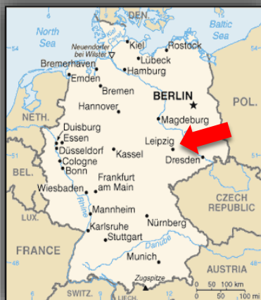
Where is Leipzig?

Deaconess in Deutschland Vol. 1, No. 1 – December 2017