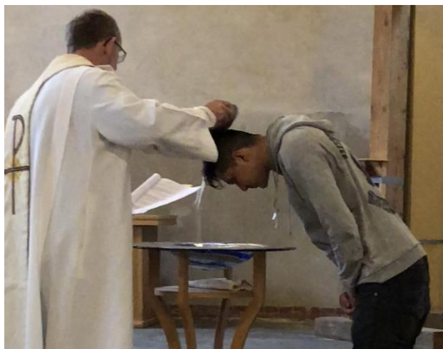
A young man from Afghanistan was baptized on Easter Monday.