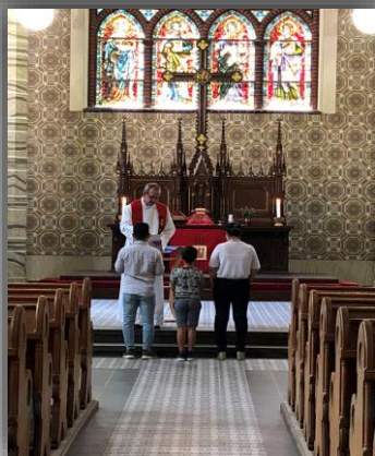
The first baptisms in the newly restored St. Lukaskirche.