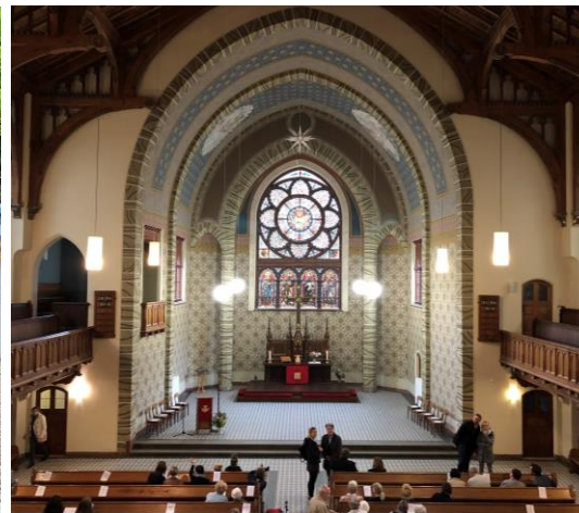
Inside St. Lukaskirche on dedication day.

It has been an exciting and busy summer here in Leipzig! After seven refugees were baptized on Pentecost, we kicked off the summer by celebrating the dedication of the restored altar in our newly restored church building. The day began with a special neighborhood festival to which all were invited. We served cake and coffee and offered various activities, including live music and a bicycle taxi!