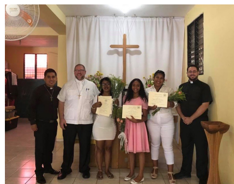
Easter Day baptism and confirmations in "old" Pueblo Nuevo church!