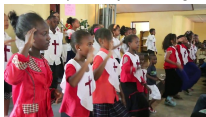
Children celebrate Easter in 2016

Additionally, we are just finishing Holy Week and will celebrate Easter tomorrow. The