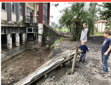
Renovation of a campus building

The government has announced that they are allowing our school to open. We will still need to practice reasonable precautions, such as masks, handwashing, social-distancing, etc. That will present some challenges for us. Our classrooms are not large enough to social distance with all students present, so we many need to break our