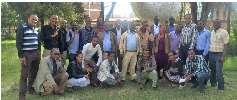
Mekane Yesus: Pictured here is the Year I Masters Class posing on the Mekane Yesus Seminary Compound.

Mekane Yesus Seminary —In our July newsletter I wrote about the far-reaching effects of our teaching efforts here at the seminaries. In that article, I talked about two students that I was beginning to advise and how we are teaching the teachers of the next generation of pastors for the EECMY. I was excited about those opportunities in July, but now that classes are in full swing and I have gotten to know my students better, I am truly amazed at the incredible opportunity the Lord has given us. It is much, much greater than I realized before.