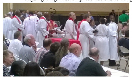
Southern District Convention Opening Service