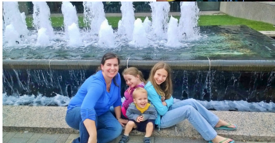
On our way to a presentation—stopped and snapped a picture by a fountain in Kansas City, Kansas