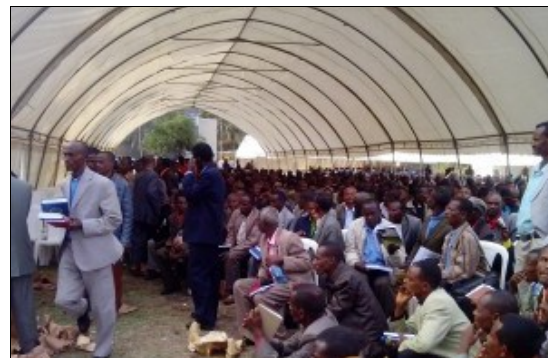
Pastors receiving their Book of Concord

The Book of Concord , our Lutheran confessions, is foundational and indispensable to our Lutheran identity . It was compiled in 1580 and accepted as the definitive explanation of what the Bible teaches and therefore, what Lutherans believe. This book is so important, that in the LCMS it is used as a primary text book in our seminaries from the first semester of the first year all the way through to graduation. At ordination, LCMS pastors make a vow that all they teach and preach will be in accord with this book. The LCMS constitution declares this book to be “a true and unadulterated statement and exposition of the Word of God.” Simply put: if you believe what the book of Concord teaches, you are Lutheran. . .if you do not believe the teachings of the Book of Concord, you are not.