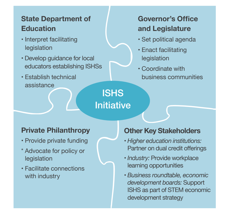
Figure 1. Aligned Key State-Level Stakeholders for ISHS Initiative

Bringing Inclusive STEM High Schools to Scale: Policy Lessons from Three States