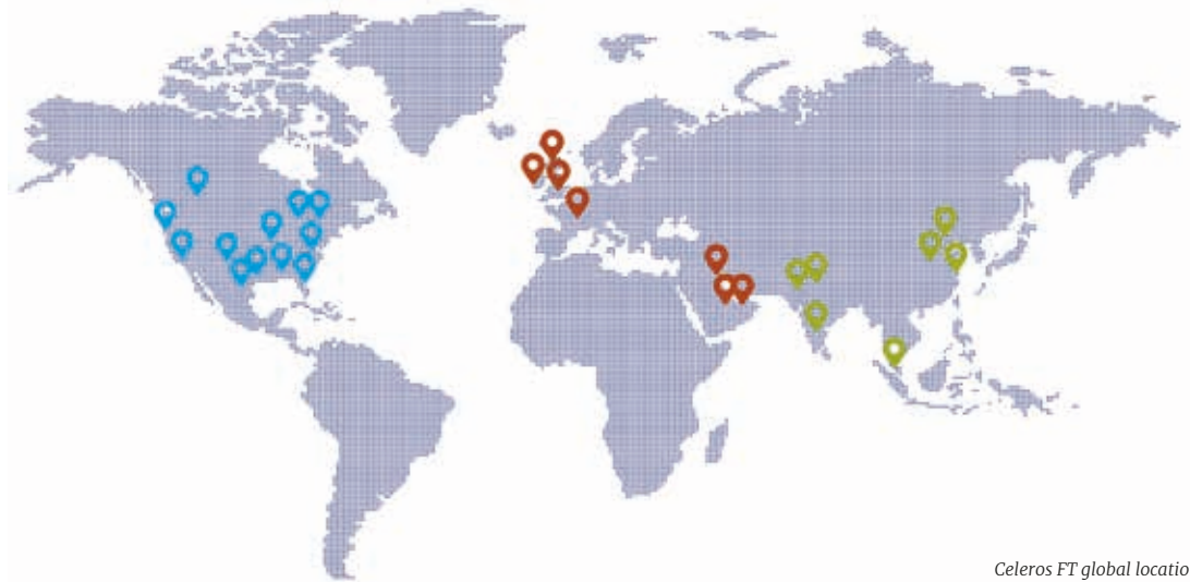
Celeros FT global locations