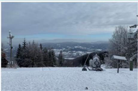
The view from the top after hiking with Asia and Becia from my church.

Anyone that knows me well can verify that hiking is one of my least favorite activities. Ironically enough I live in an area where hiking is an extremely popular activity. Although it is not my favorite, I found hiking opens the doors to engage in deep conversations with your hiking buddies. The last hike I embarked on was with the pastor's daughter from my church and our youth leader. We talked about many things including how the ministry is going at church. On the top we ate soup at the lodge and even had time for a little snowball fight on the way down! What a blessing to build relationships while appreciating God's creation.