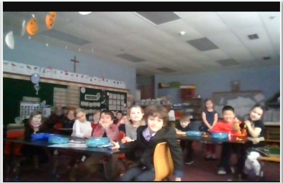
Above: A picture of the Kindergarteners from Trinity Lutheran School in Atchison, Kansas. In this moment I learned how difficult it can be to take a picture with a bunch of excited six year olds, hence the blurry photo!