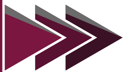
Exhibit & Sponsorship Prospectus