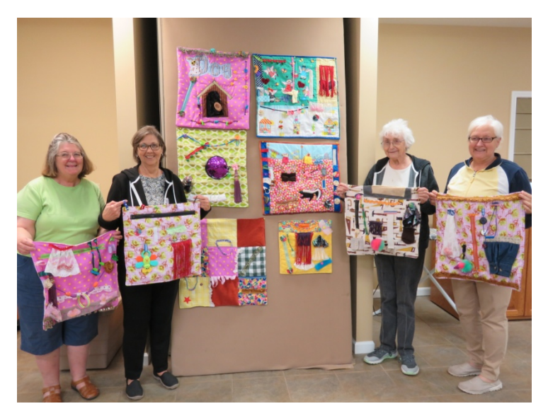
Samples provided by: Sassy Stitchers of Lincoln County